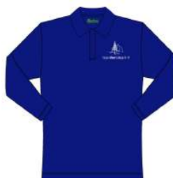
LS Polo R-6