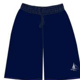
PE Short 7-12