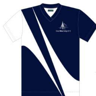
PE Top 7-12