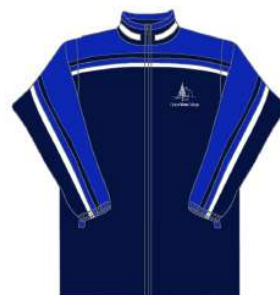
Spray Jacket 7-12